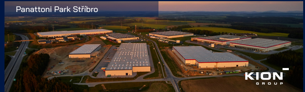
Panattoni Park Stříbro

Location: Ostrov u Stříbra, Pilsen Region