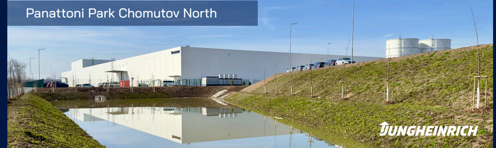
Panattoni Park Chomutov North